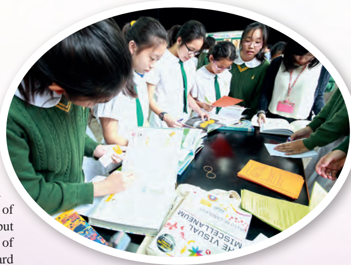
▲ So many books, so little time! Students make a start at the annual Reading Festival

The awardees believe that each student is unique with their own talents and everyone acquires language skills in different ways. In other words, the best way of teaching English proficiency for a particular student may not work well for others. Therefore, the crux of designing an English Language curriculum is to address the different needs of learners. For example, in activities such as debate and public speaking, there