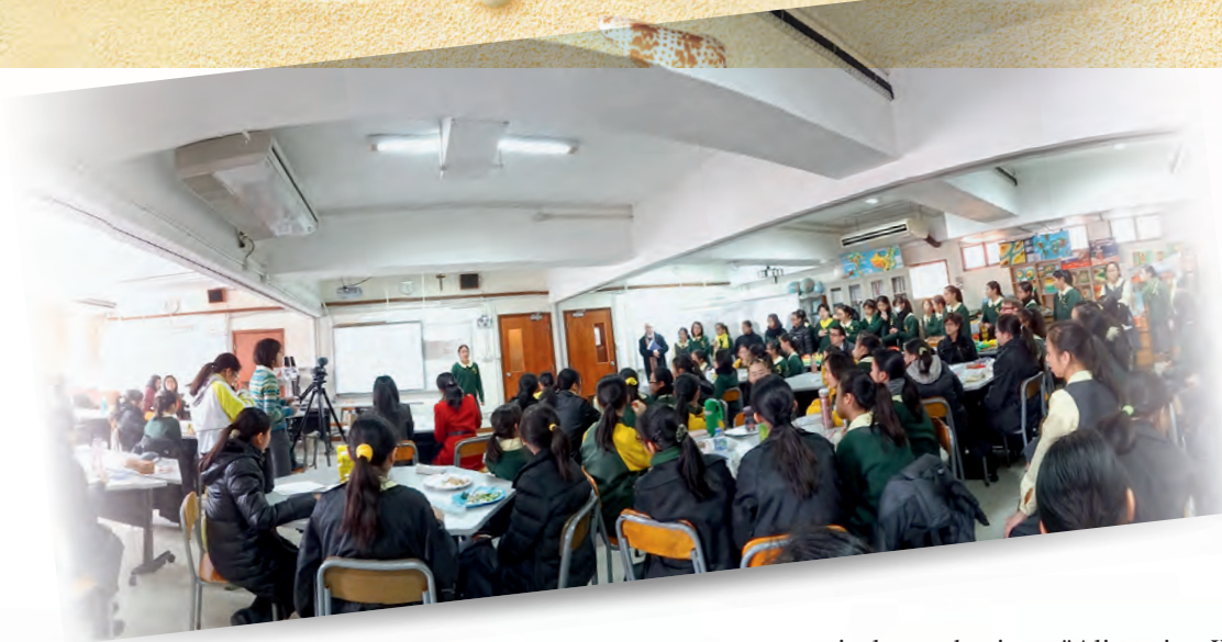
◀ Demonstrating their competitive spirit at the Inter-class Public Speaking Competition

"The debate content is tailor-made to fit into our curriculum across all levels in the school. Students take up different roles at different times so that they can learn at their own pace. The less outspoken students might be assigned with assisting roles to help prepare floor questions and present the research materials to the debaters. Later on, these students will advance to be speakers or debaters, assuming more important or leading roles in competitions."