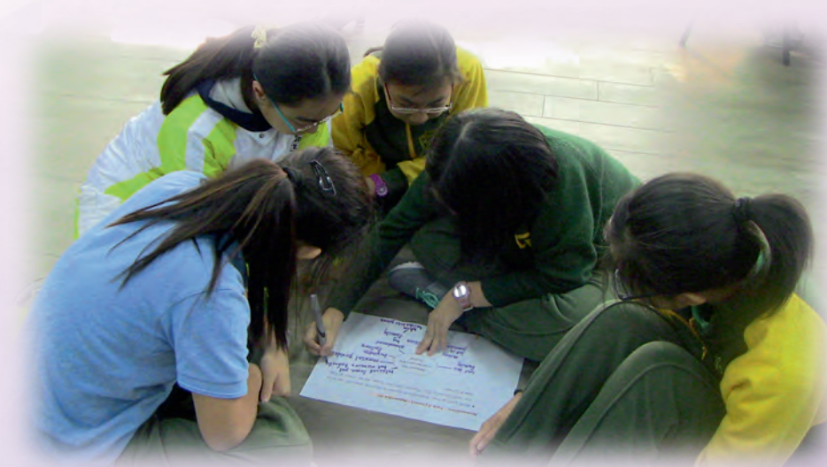
▲ Putting their heads together in a mind-mapping activity

For the future, the panel of teachers is currently exploring the feasibility of transforming the classroom into a "court room". A "court room"? Yes, they plan to add a mock trial into their English Language