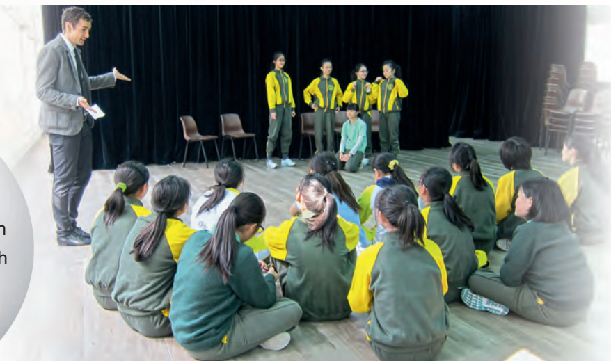
▲ Enhancing students' creativity and free expression through drama activities

Enhancing students' learning outcomes through an integrated approach based on language arts and literature