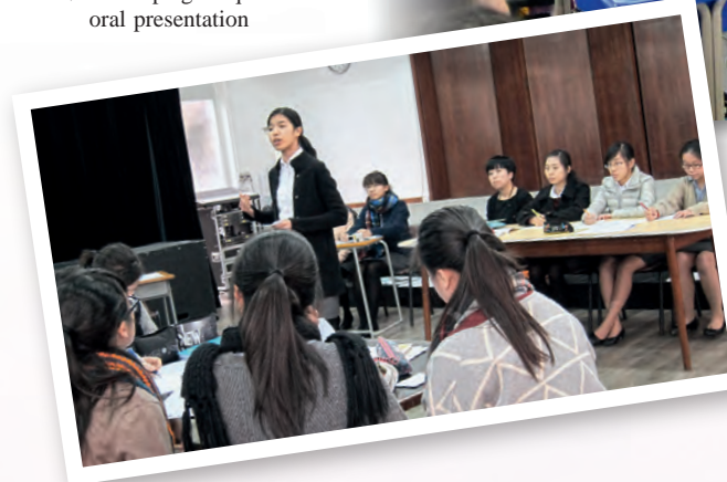
▼ Developing eloquence in oral presentation

In particular, an integrated curriculum incorporating English Language, Literature and Drama has been established. In English lessons, students intensively study selected pieces of short prose, poetry and novels. Based on these texts, students are aided to attain a deeper level of understanding of their content. For example, they are given opportunities to establish empathy with the characters, or challenged to interpret a wide range of language and experience in contextualised settings. Furthermore, students are encouraged to invent their own additions to the text and content in their drama performances, through activities like scriptwriting, and insertion of original, authentic dialogue for use.