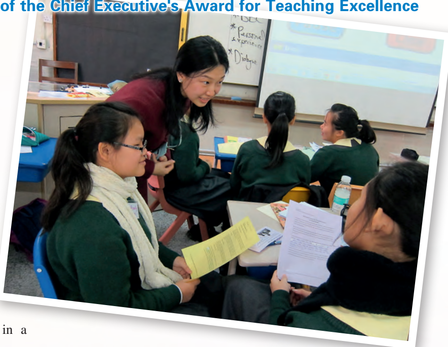
▲ Brainstorming ideas during process writing

Across all levels, we aim to cultivate a self-learning habit, and to develop students' sensitivity to language use and cultural differences. Through the holistic